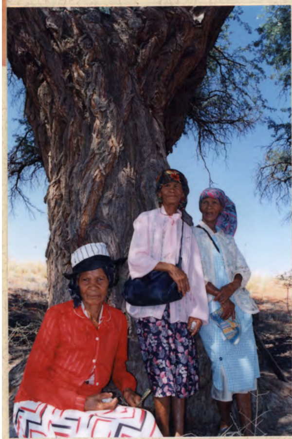
Umbhalo losesitfombeni: emantfombatane aka-Swartkop lakhuluma lulwimi lwesi-N|uu, ativeta ngabo-1990 futsi ngekuhamba kwesikhatsi aba tishosovu telulwimi lwabo, emasiko kanye nemagugu.