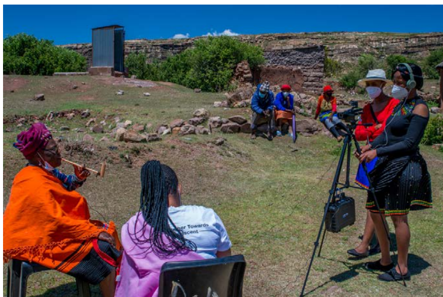
Recording an interview with a siPhuthi speaker from South Africa at the annual Murena Moorosi commemoration event