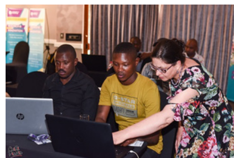
Attendees and presenters at the Digital Humanities Summer School